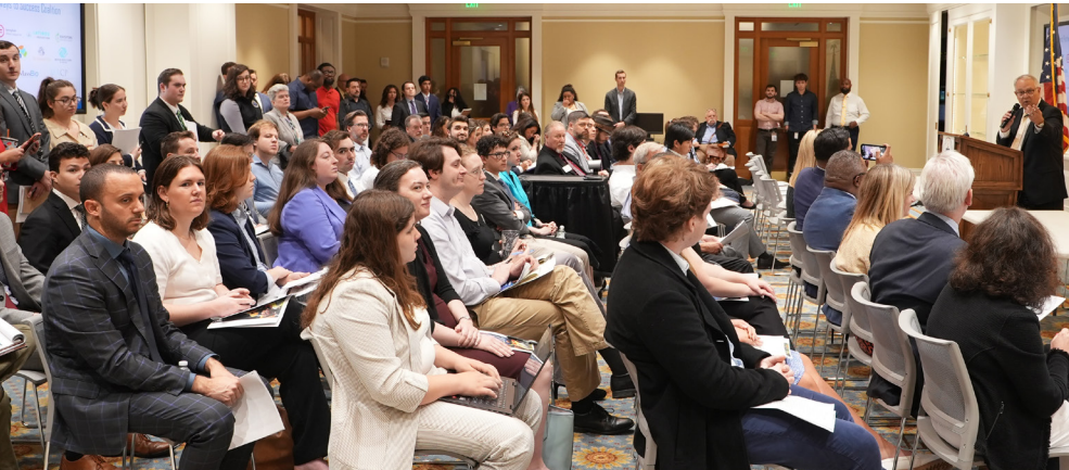
A packed-house at our legislative briefing at the State House in June.

The Coalition was proud to support and celebrate a new $5 million pathways line item in the FY24 state budget that can be used to expand Early College, Innovation Career Pathways, STEM Tech Career Academies and more, and signals a commitment to growing pathways in the years to come.